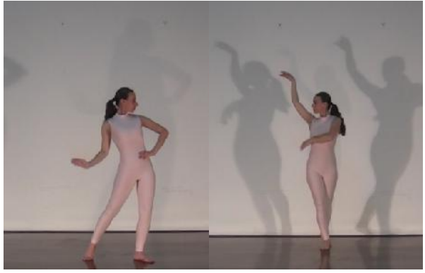
Fig.5 Wavelike lines

Wavelike lines (symbolizing adaptation to change and the movement both of water and air);