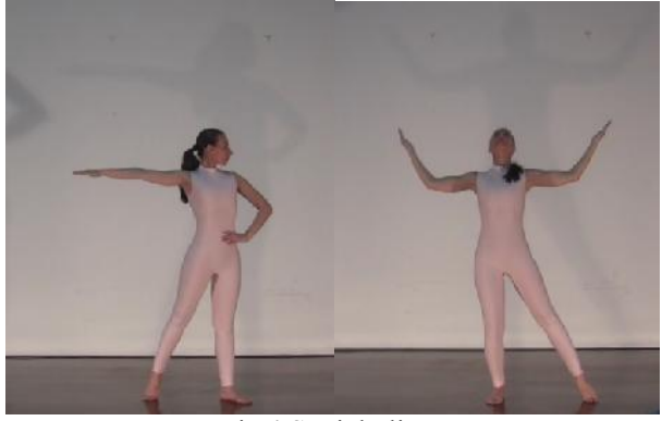
Fig.4 Straight lines

Straight lines (symbolizing the focus, attention, awareness, strength, balance and the confidence of the being);