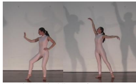
Fig.2 Gentle, delicate, soft movement

Gentle, delicate, soft movement (symbolic of effortlessness and respect for the body);