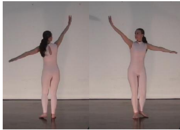
Fig.6 Rotations and Translations

Rotations and Translations (symbolizing the movements of rotation and translation of the Earth)