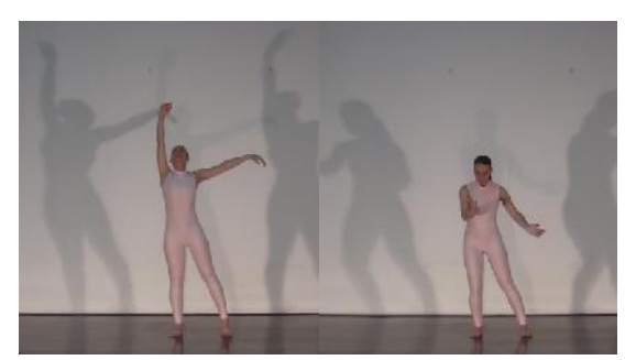
Fig.1 Movement synchronization with breathing

2.3 Key features. Movement synchronization with breathing (in Yoga, the conscious breathing is a fundamental element and the movement of Extemporaneous Dance is based on the coordination of movements with breathing. Thus, in general, upward movements are made inhaling and the downward movements, exhaling);